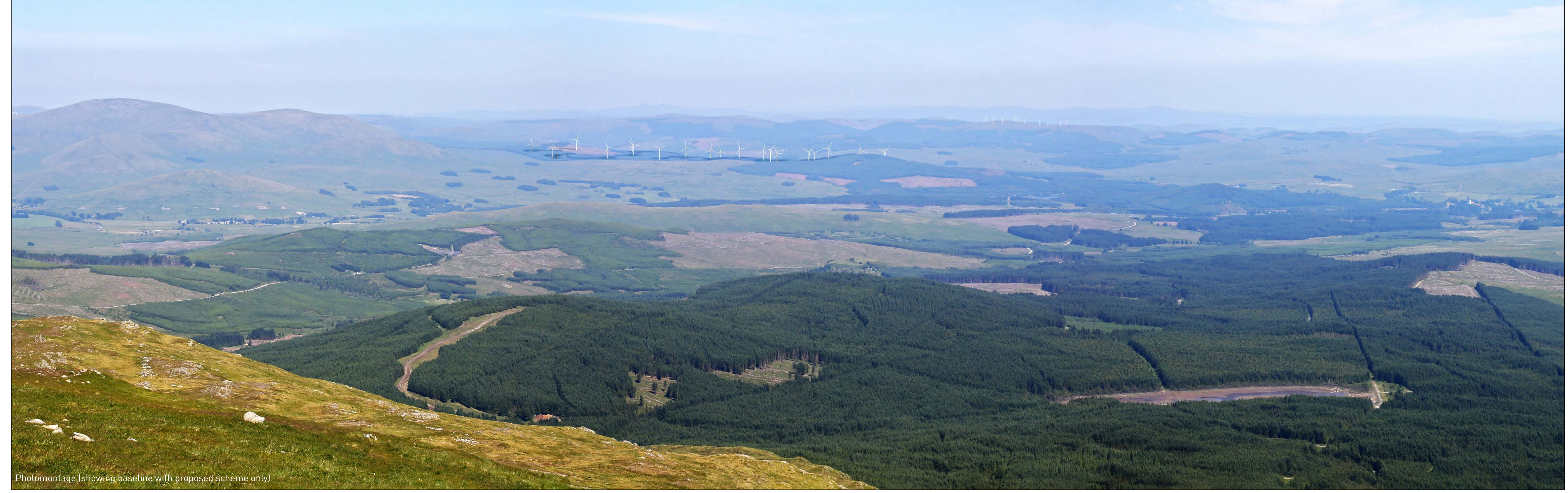
Figure 8.57 (sheet C) Viewpoint 21: Corserine (Hennessy's Shelter) SHEPHERDS' RIG WIND FARM